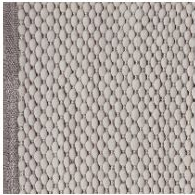
Dakar Light Grey

Materials, fabrics, leathers, colors and finishes are approximate and may slightly differ from actual ones. You can find the complete collection of Bonaldo fabrics and leathers on the website