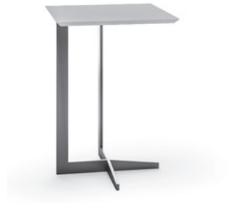
TAVOLINO / COFFEE TABLE