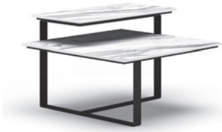
TAVOLINO / COFFEE TABLE