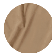
Eco Nabuk 51 Colours available