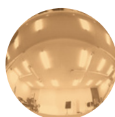
Metal 4 finishes available