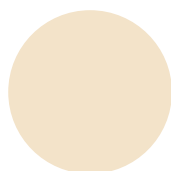
Lacquers 18 colours available