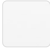
white (white edge)